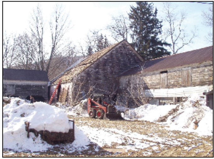
Photo 1. The River Street barn standing on its former site in Middleburgh, looking east, 2003.

Preservationists enjoy trumping the latest generation of sustainability promoters by declaring that the 'greenest' building is one that already exists, preferably an historic one. The River Street Dutch Barn is proof that the art of sustainable building has always existed, given these key ingredients could come together; simple, efficient design, quality craftsmanship and materials, and a succession of owners who know the value accrued by maintaining their buildings.