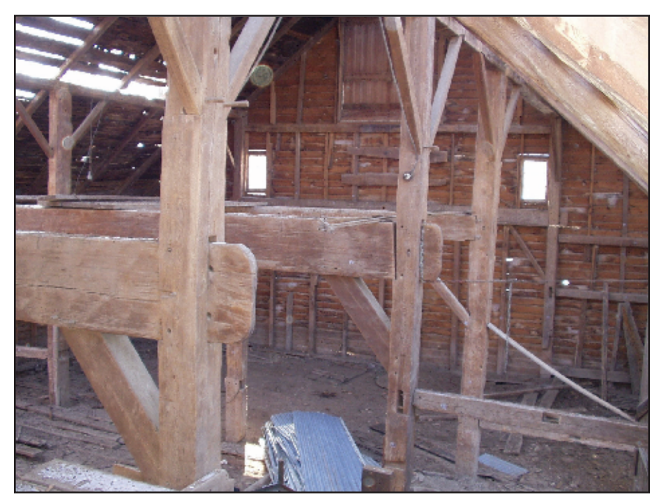
Photo 3. Interior as it looked in Middleburgh showing added bay, looking west, from the loft.

From the four main Dutch Hbents, it seems the barn began its life as an average-sized, three-bay barn, 45-feet wide by 35-feet long, with a 26-foot wide center aisle and equal 9-1/2-foot side aisles. It had 12-foot high side walls and 10'' \ge 22'' inch center anchor beams and very nicely made 7'' \ge 10'' braces.