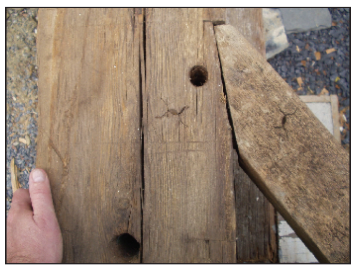
Photo 2. Joint with strange symbol made from round gouge strikes.

raiding parties in the Revolutionary War. Given its last location less than a hundred yards from the Schoharie Creek and within the Middleburgh Village limits, it's possible that it was part of the first phase of barn rebuilding after the war.