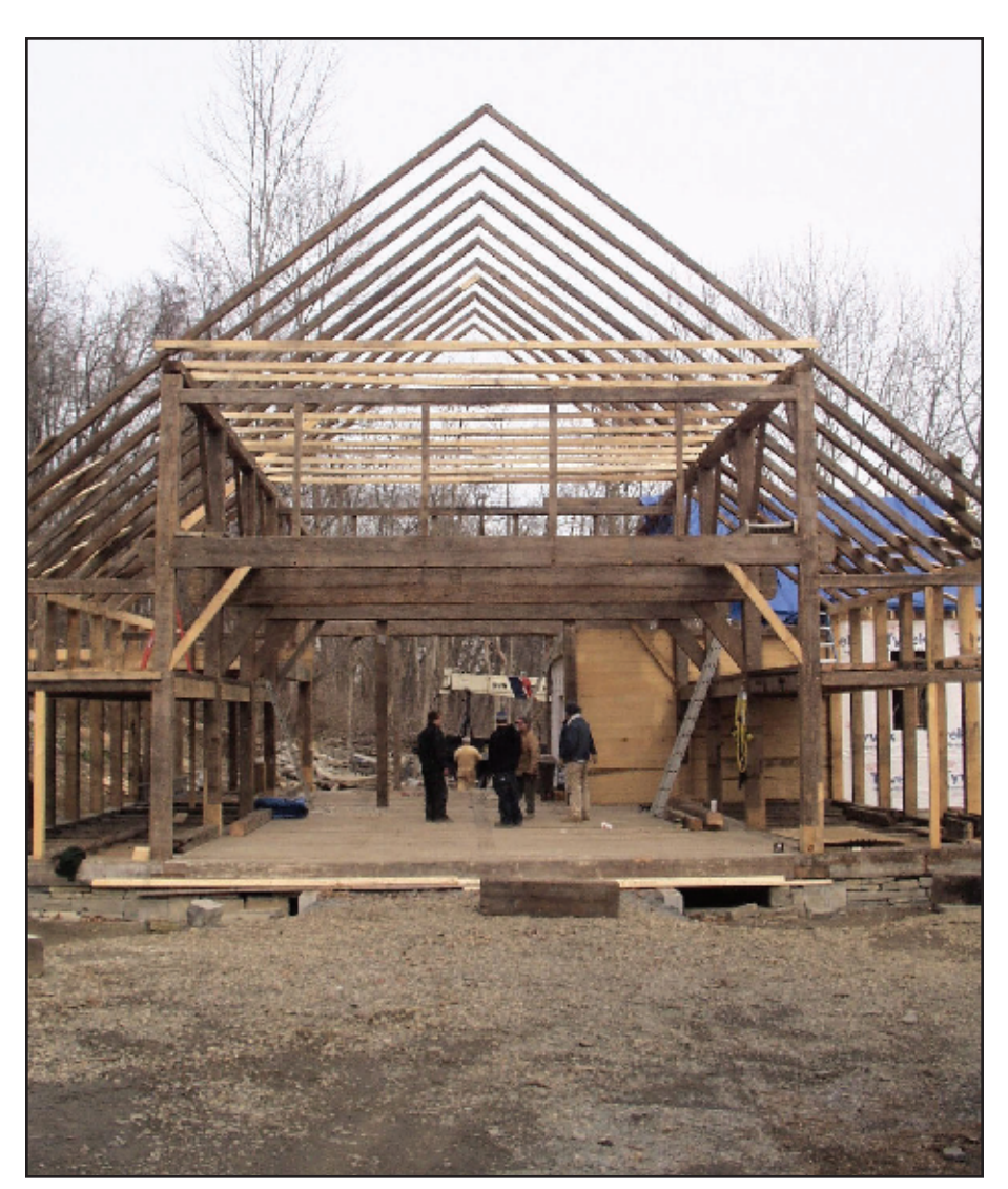
Photo 4. River Street barn on its new site, November 2009. Old rafters are up on the 3-bay section. Partial siding on 'interior' gable wall that will separate the barn from the workshop.

The River Street Barn has passed that test several times; just pick any one of its lives!