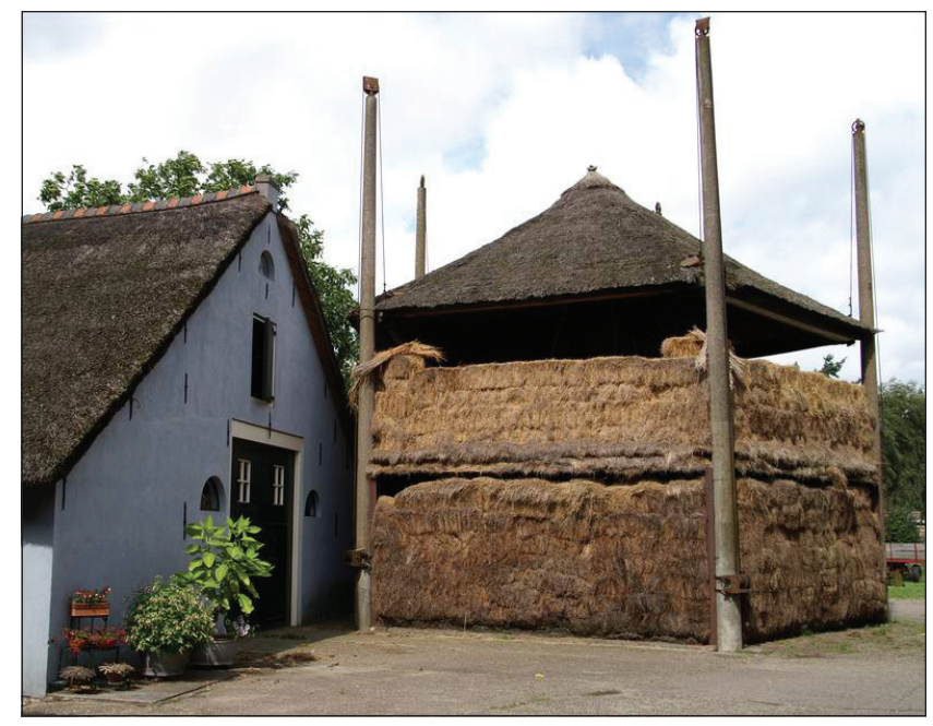
Figure 3. Four-pole hooiberg with pulleys at Franschepad, Blaricum, Netherlands.

part boarded at the sides and a floor laid over and the hay at top and the cow stable under.4