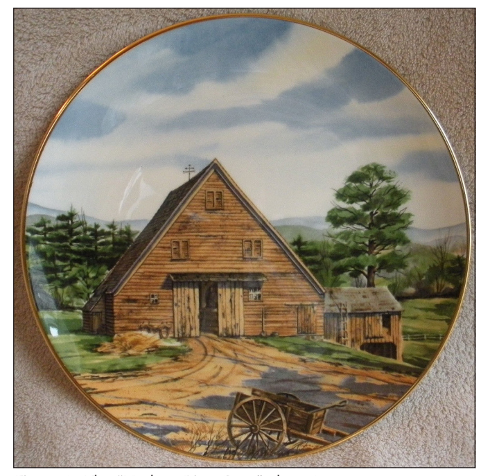
Figure 1. The "Hudson River Barn" plate, 1983.

The decidedly Dutch influence of early settlers along New York's Hudson River Valley is seen in a tall, nearly "A" frame structure with steeply pitched roof. Most often built on the highest point of land to avoid spring floods, the Hudson River Barn of-