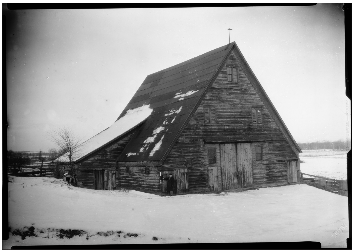
Figure 2. The Teller-Schermerhorn barn, Historic American Buildings Survey photograph.