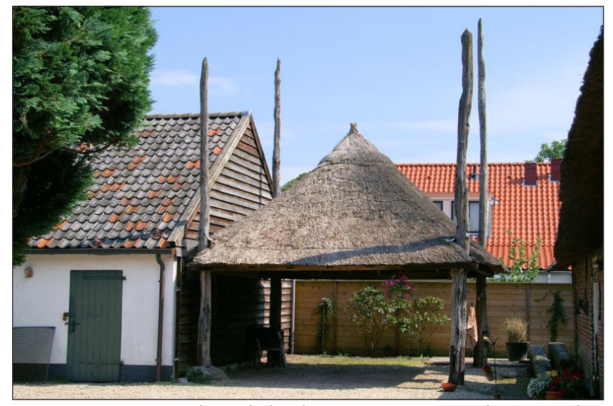
Figure 2. A circa 1930s four-pole hooiberg at Eemnesserweg, Blaricum, Netherlands.

bottom unsquared. This is all above ground. In the square part of the poles there are holes bored thro at the distance of twelve inches big enough for a strong iron pin to be put thro to suport [sic] four wall plates which are tennanted [sic] at the ends, then some light spars are put upon the wall plates and thatch upon them. When it was only five feet from the ground, the room can be raised at pleasure 21 feet or any distance from the ground between that and five feet. These are to put hay or any kind of grain under and the roof is always ready to shelter from hasty rains which is common hear [sic] in summer. Those that only have two cows have the bottom