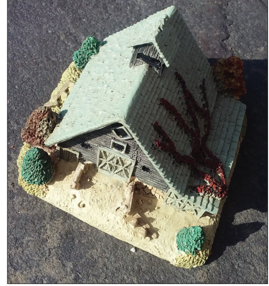
Figure 4. Verplanck barn, now at Mount Gulian (photographer unidentified).