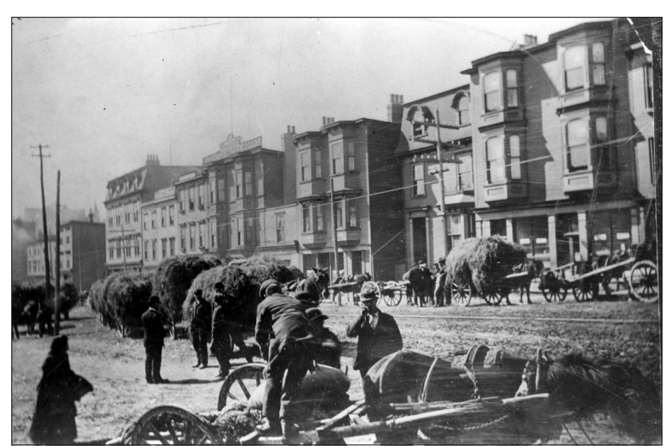
Figure 6. An undated photo of Haymarket Square, Duckworth Street, St John's, showing hay wagons, probably late 1890s or early 1900s. City of St. John's Archives photograph 01-13-

intervale land along the rivers, and even on the small islands in the rivers. The hay in barracks is sometimes hauled in winter over the snow and ice to the barn. Farmers who don't have a hay barn find the hay barrack a useful and inexpensive replacement for a large hav barn. An unassisted farmer, with materials readily available on his farm can easily build it.<sup>23</sup>