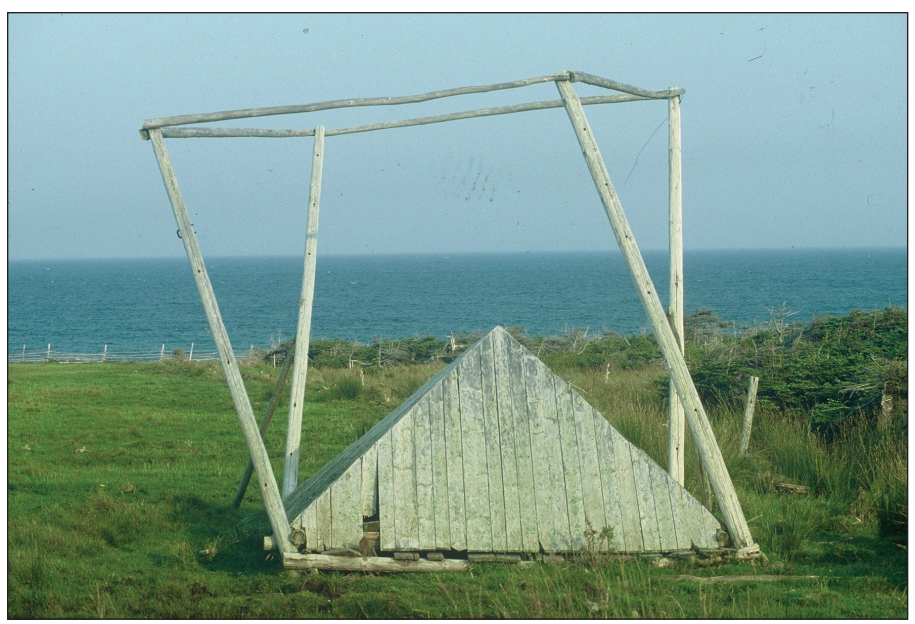
Figure 8. Cape Anguille hay barrack, early 1990s.

you tended to store the oats outside, or other grains, and the straw that way. You probably would have put your better hay in the barn and you probably would have put straw, oats and whatnot in the outside stack. So it had kind of a diverse use.