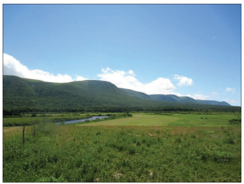
Figure 5. A view of the Codroy Valley.

Today, the Magdalene Islands are one of the few places in Atlantic Canada with extant hay barracks. The remarkable stained-glass east window in the Holy Trinity church, Grosse-Île, depicts Jesus, "calling the first disciples, but with modern Magdalen Islands touches.