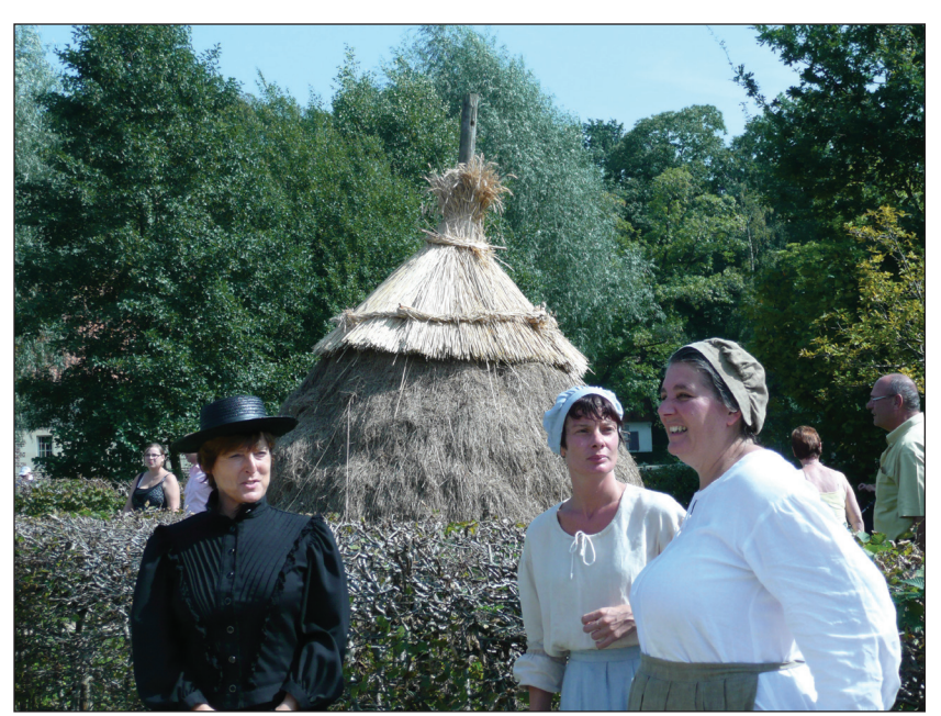
Figure 4. A hooimijt at Domein Bokrijk, Belgium, 2008.

Dutch; a hooiberg denotes in Flanders rather a large heap of hay, while a hooimijt designates a somehow more limited amount of hay/straw/grains, arranged/ stacked in a practical and conical way, sometimes around a wooden pole; and a hooiberg in Holland denotes different regional varieties of a wooden pole structure meant to stack hay.... The meaning and use of both words is not that straightforward, I am afraid. Apart from that there are more words competing for parts of the same meaning, for eg. hooistapel (literal translation: staple of hay) which is still a common word, but also the more archaic hooischelf. In the local dialects there are even more words for more or less the same idea—'a heap of hay'—to be reaped, but that is another story.8