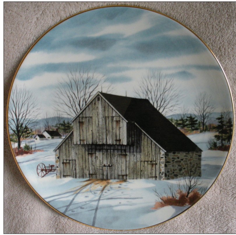
Figure 3. The "Forebay Barn" plate, 1983.

ten became a rambling structure as additional sheds and rooms were added to the main structure over the years. Sawmills were common along the Hudson and the planked siding was commonly available. 1