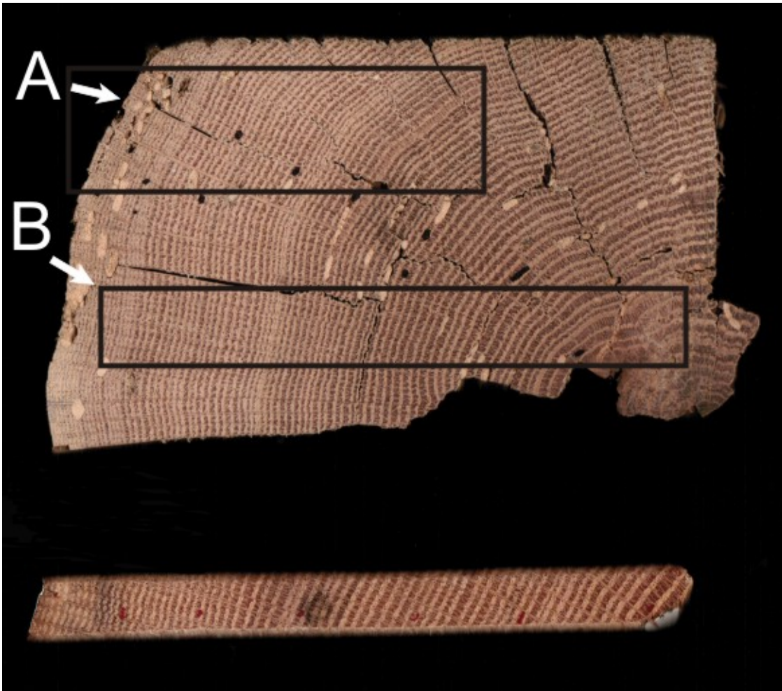
Figure 1. A cross-section of an oak timber with sapwood rings on the left-hand side (above). The boxes illustrate conversion methods resulting in A ) a precise felling date and B ) a terminus post quem or felled after date. Also pictured is a core showing complete sapwood (below).