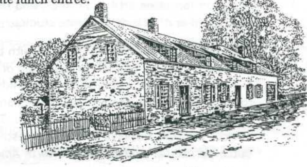
THE SENATE HOUSE

One of the proposed idea for a HVVA fund raising event is to host a vernacular house tour. This project will require a lot of planning, but could put us on good financial ground. Although the board would hold final approval, a committee of interested members should be formed to do a majority of the planning in caucus, rather than adding to the length of the general monthly board meetings. If you are interest in this project please contact one of our board members and we would be delighted to get anyone with interest involved. The tour would more than likely be in September 2006. Not only do we need our members to be planners, we are going to need their house as well. If you own a historic house and would like to offer the house for the tour please let us know. At this point we are looking for interested property owners just to see what we come up with, then we can see if we want to localize the tour or open it up to the whole area and call it an HVVA Open House Day. Many of us are very fortunate to live in one of these wonderful historic structures, I always welcome any chance to bring others into them and share the unique qualities of these homes. A house tour for the general public is one of the best ways to preserve our architectural heritage. So please get on board and offer your help and your home. Lets hear from you soon so the work can