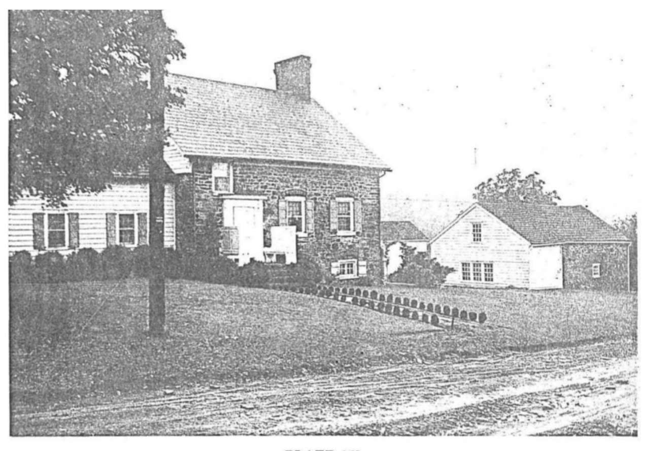
PLATE 158 Howsel—Wagoner House Stanton

2. 12 - Slow drive-by - Howsel-Wagoner house and stone barn - 172 Stanton Road - Rosalie Fellows Bailey (plate 158). Note: the house number is in green on an electric pole past the house. It is not on the mail box.