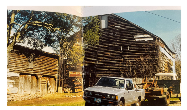
Wyckoff/Wade barn in its original location before it was dismantled.

The Wyckoff -Wade barn was moved to the Bouman-Stickney Farm from the Wade Farm off Readington Road in Readington Township in 2000 by the New Jersey Barn Company. It was believed to have been built by John Wyckoff, a second generation American of Dutch ancestry The anchor beams are 27' long. The center aisle is 27' x 41'. The photo below shows the barn in its original location and raised for more hay storage. The associated house had two walls stone and two walls frame.