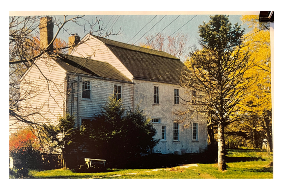
The house that was formerly associated with the Wyckoff/Wade barn

2. 12 - Slow drive-by - Howsel-Wagoner house and stone barn - 172 Stanton Road - Rosalie Fellows Bailey (plate 158). Note: the house number is in green on an electric pole past the house. It is not on the mail box.